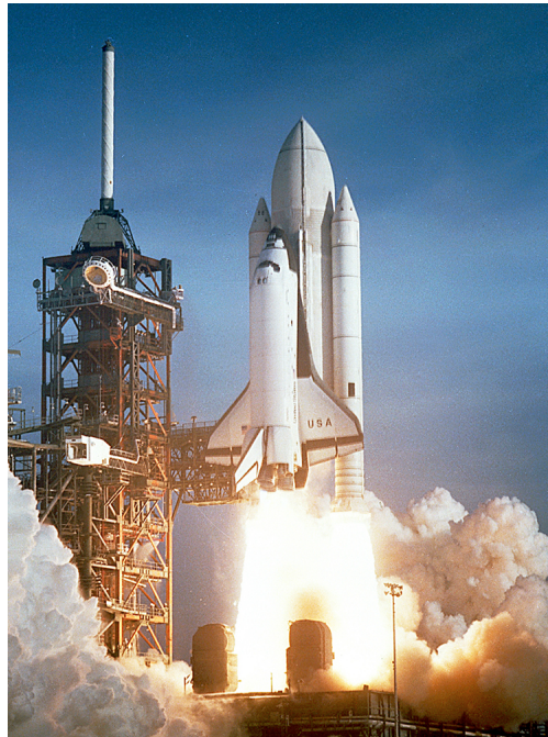
FIGURE 8.13 The space shuttle had a number of reusable parts. Solid fuel boosters on either side were recovered and refueled after each flight, and the entire orbiter returned to Earth for use in subsequent flights. The large liquid fuel tank was expended. The space shuttle was a complex assemblage of technologies, employing both solid and liquid fuel and pioneering ceramic tiles as reentry heat shields. As a result, it permitted multiple launches as opposed to single-use rockets. (credit: NASA)

The space shuttle was an attempt at an economical vehicle with some reusable parts, such as the solid fuel boosters and the craft itself. (See Figure 8.13 ) The shuttle's need to be operated by humans, however, made it at least as costly for launching satellites as expendable, unpiloted rockets. Ideally, the shuttle would only have been used when human activities were required for the success of a mission, such as the repair of the Hubble space telescope. Rockets with satellites can also be launched from airplanes. Using airplanes has the double advantage that the initial velocity is significantly above zero and a rocket can avoid most of the atmosphere's resistance.