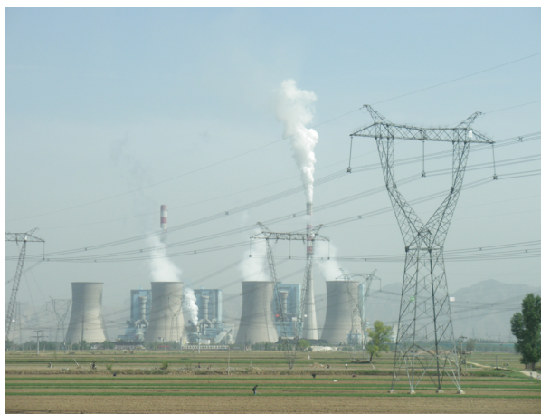
FIGURE 7.22 Tremendous amounts of electric power are generated by coal-fired power plants such as this one in China, but an even larger amount of power goes into heat transfer to the surroundings. The large cooling towers here are needed to transfer heat as rapidly as it is produced. The transfer of heat is not unique to coal plants but is an unavoidable consequence of generating electric power from any fuel—nuclear, coal, oil, natural gas, or the like.

Examples of power are limited only by the imagination, because there are as many types as there are forms of work and energy. (See Table 7.3 for some examples.) Sunlight reaching Earth's surface carries a maximum power of about 1.3 kilowatts per square meter ( \text{kW/m}^2 ). A tiny fraction of this is retained by Earth over the long term. Our consumption rate of fossil fuels is far greater than the rate at which they are stored, so it is inevitable that they will be depleted. Power implies that energy is transferred, perhaps changing form. It is never possible to change one form completely into another without losing some of it as thermal energy. For example, a 60-W incandescent bulb converts only 5 W of electrical power to light, with 55 W dissipating into thermal energy. Furthermore, the typical electric power plant converts only 35 to 40% of its fuel into electricity. The remainder becomes a huge amount of thermal energy that must be dispersed as heat transfer, as rapidly as it is created. A coal-fired power plant may produce 1000 megawatts; 1 megawatt (MW) is 10^6 W of electric power. But the power plant consumes chemical energy at a rate of about 2500 MW, creating heat transfer to the surroundings at a rate of 1500 MW. (See Figure 7.22 .)