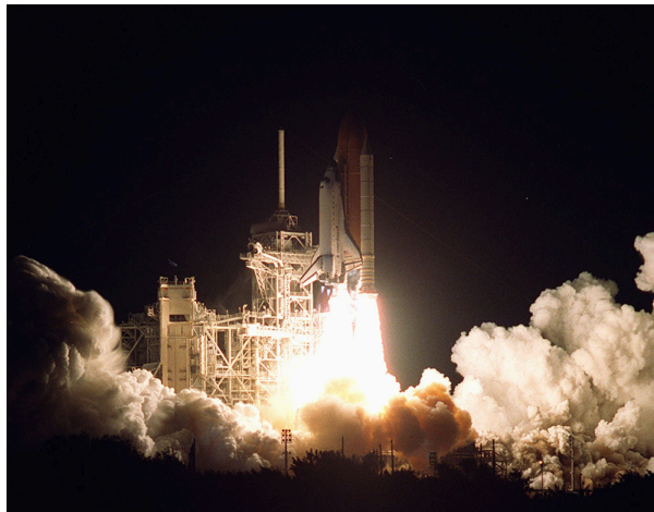
FIGURE 7.20 This powerful rocket on the Space Shuttle Endeavour did work and consumed energy at a very high rate. (credit: NASA)

These images of power have in common the rapid performance of work, consistent with the scientific definition of power ( P ) as the rate at which work is done.