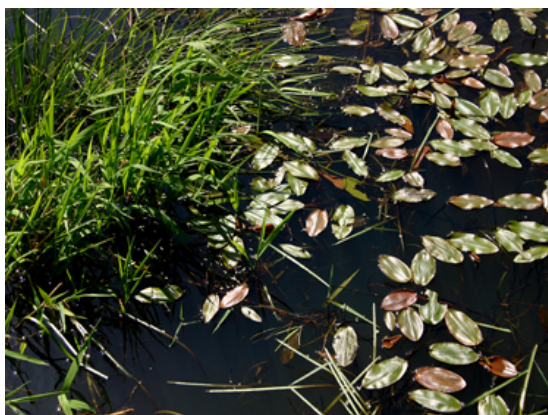
FIGURE 34.20 Dark matter may shepherd normal matter gravitationally in space, as this stream moves the leaves. Dark matter may be invisible and even move through the normal matter, as neutrinos penetrate us without small-scale effect. (credit: Shinichi Sugiyama)

Some particle theorists have built WIMPs into their unified force theories and into the inflationary scenario of the evolution of the universe so popular today. These particles would have been produced in just the correct numbers to make the universe flat, shortly after the Big Bang. The proposal is radical in the sense that it invokes entirely new forms of matter, in fact two entirely new forms, in order to explain dark matter and other phenomena. WIMPs have the extra burden of automatically being very difficult to observe directly. This is somewhat analogous to quark confinement, which guarantees that quarks are there, but they can never be seen directly. One of the primary goals of the LHC at CERN, however, is to produce and detect WIMPs. At any rate, before WIMPs are accepted as the best explanation, all other possibilities utilizing known phenomena will have to be shown inferior. Should that occur, we will be in the unanticipated position of admitting that, to date, all we know is only 10% of what exists. A far cry from the days when people firmly believed themselves to be not only the center of the universe, but also the reason for its existence.