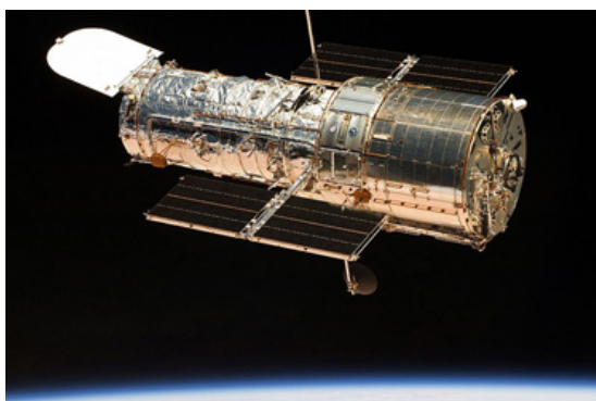
FIGURE 34.19 The Hubble Space Telescope is producing exciting data with its corrected optics and with the absence of atmospheric distortion. It has observed some MACHOs, disks of material around stars thought to precede planet formation, black hole candidates, and collisions of comets with Jupiter.