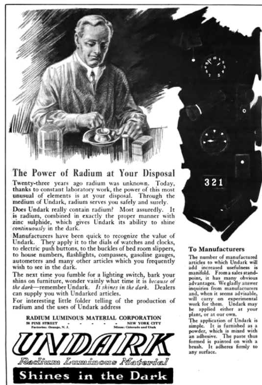
FIGURE 32.8 The properties of radiation were once touted for far more than its modern use in cancer therapy. Until 1932, radium was advertised for a variety of uses, often with tragic results.

The earliest uses of ionizing radiation on humans were mostly harmful, with many at the level of snake oil as seen in Figure 32.8 . Radium-doped cosmetics that glowed in the dark were used around the time of World War I. As recently as the 1950s, radon mine tours were promoted as healthful and rejuvenating—those who toured were exposed but gained no benefits. Radium salts were sold as health elixirs for many years. The gruesome death of a wealthy industrialist, who became psychologically addicted to the brew, alerted the unsuspecting to the dangers of radium salt elixirs. Most abuses finally ended after the legislation in the 1950s.