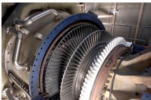
FIGURE 23.23 Steam turbine/generator. The steam produced by burning coal impacts the turbine blades, turning the shaft which is connected to the generator.

In real life, electric generators look a lot different than the figures in this section, but the principles are the same. The source of mechanical energy that turns the coil can be falling water (hydropower), steam produced by the burning of fossil fuels, or the kinetic energy of wind. Figure 23.23 shows a cutaway view of a steam turbine; steam moves over the blades connected to the shaft, which rotates the coil within the generator.