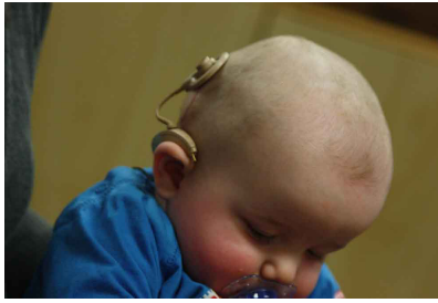
FIGURE 23.9 Electromagnetic induction used in transmitting electric currents across mediums. The device on the baby's head induces an electrical current in a receiver secured in the bone beneath the skin.

Another contemporary area of research in which electromagnetic induction is being successfully implemented (and with substantial potential) is transcranial magnetic stimulation. A host of disorders, including depression and hallucinations can be traced to irregular localized electrical activity in the brain. In transcranial magnetic stimulation , a rapidly varying and very localized magnetic field is placed close to certain sites identified in the brain. Weak electric currents are induced in the identified sites and can result in recovery of electrical functioning in the brain tissue.