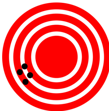
FIGURE 1.24 In this figure, the dots are concentrated rather closely to one another, indicating high precision, but they are rather far away from the actual location of the restaurant, indicating low accuracy.