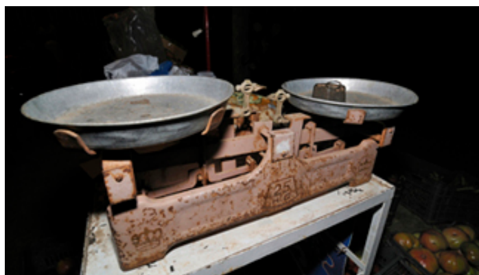
FIGURE 1.21 A double-pan mechanical balance is used to compare different masses. Usually an object with unknown mass is placed in one pan and objects of known mass are placed in the other pan. When the bar that connects the two pans is horizontal, then the masses in both pans are equal. The “known masses” are typically metal cylinders of standard mass such as 1 gram, 10 grams, and 100 grams.