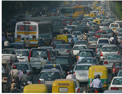
FIGURE 17.11 Noise on crowded roadways like this one in Delhi makes it hard to hear others unless they shout.

In a quiet forest, you can sometimes hear a single leaf fall to the ground. After settling into bed, you may hear your blood pulsing through your ears. But when a passing motorist has his stereo turned up, you cannot even hear what the person next to you in your car is saying. We are all very familiar with the loudness of sounds and aware that they are related to how energetically the source is vibrating. In cartoons depicting a screaming person (or an animal making a loud noise), the cartoonist often shows an open mouth with a vibrating uvula, the hanging tissue at the back of the mouth, to suggest a loud sound coming from the throat Figure 17.12 . High noise exposure is hazardous to hearing, and it is common for musicians to have hearing losses that are sufficiently severe that they interfere with the musicians' abilities to perform. The relevant physical quantity is sound intensity, a concept that is valid for all sounds whether or not they are in the audible range.