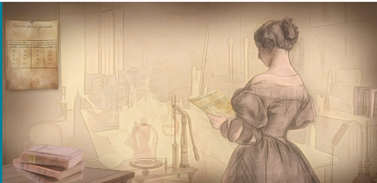
FIGURE 14.1 Eunice Newton Foote was the first to determine the relationship between carbon dioxide, water vapor, and the potential for global heating. She designed and conducted a number of experiments to uncover the ability of different gases to trap heat, describing what would later be referred to as greenhouse gases.