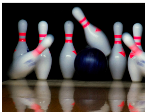
FIGURE 10.23 The bowling ball causes the pins to fly, some of them spinning violently.