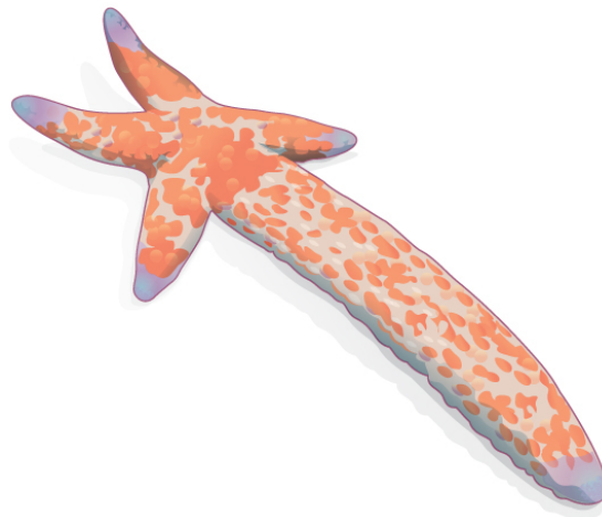
Figure 43.4 Sea stars can reproduce through fragmentation. The large arm, a fragment from another sea star, is developing into a new individual.

Note that in fragmentation, there is generally a noticeable difference in the size of the individuals, whereas in fission, two individuals of approximate size are formed.