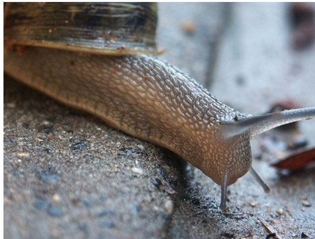
Figure 43.5 Many snails are hermaphrodites. When two individuals mate, they can produce up to one hundred eggs each.