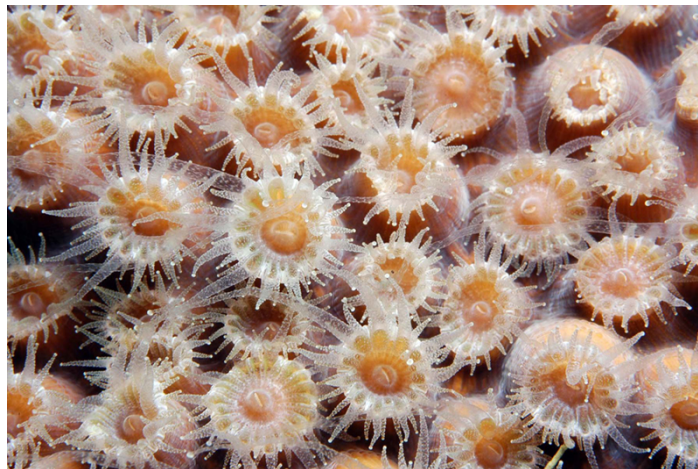
Figure 43.2 Coral polyps reproduce asexually by fission.

Fission , also called binary fission, occurs in prokaryotic microorganisms and in some invertebrate, multi-celled organisms. After a period of growth, an organism splits into two separate organisms. Some unicellular eukaryotic organisms undergo binary fission by mitosis. In other organisms, part of the individual separates and forms a second individual. This process occurs, for example, in many asteroid echinoderms through splitting of the central disk. Some sea anemones and some coral polyps ( Figure 43.2 ) also reproduce through fission.