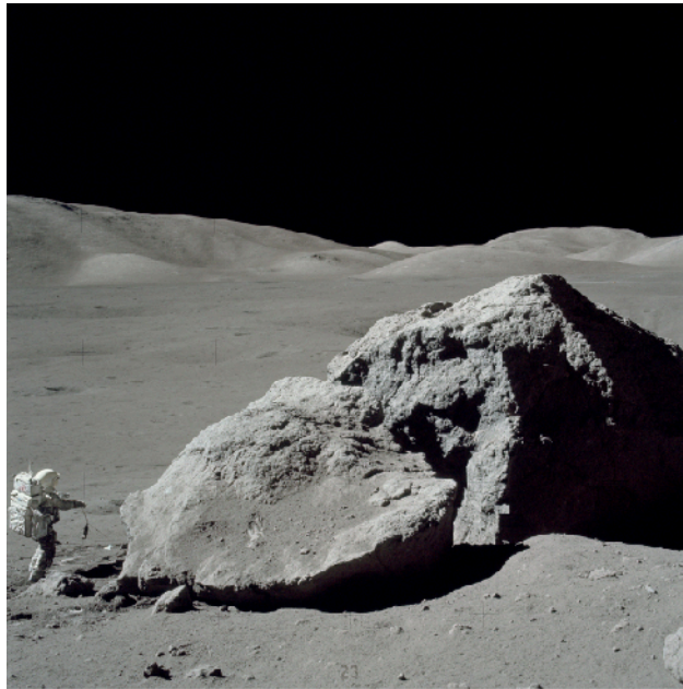
Figure 9.3 Scientist on the Moon. Geologist (and later US senator) Harrison “Jack” Schmitt in front of a large boulder in the Littrow Valley at the edge of the lunar highlands. Note how black the sky is on the airless Moon. No stars are visible because the surface is brightly lit by the Sun, and the exposure therefore is not long enough to reveal stars.

In addition to landing on the lunar surface and studying it at close range, the Apollo missions accomplished three objectives of major importance for lunar science. First, the astronauts collected nearly 400 kilograms of samples for detailed laboratory analysis on Earth ( Figure 9.4 ). These samples have revealed as much about the Moon and its history as all other lunar studies combined. Second, each Apollo landing after the first one deployed an Apollo Lunar Surface Experiment Package (ALSEP), which continued to operate for years after the astronauts departed. Third, the orbiting Apollo command modules carried a wide range of instruments to photograph and analyze the lunar surface from above.