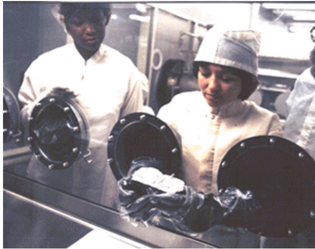
Figure 9.4 Handling Moon Rocks. Lunar samples collected in the Apollo Project are analyzed and stored in NASA facilities at the Johnson Space Center in Houston, Texas. Here, a technician examines a rock sample using gloves in a sealed environment to avoid contaminating the sample.

The last human left the Moon in December 1972, just a little more than three years after Neil Armstrong took his “giant leap for mankind.” The program of lunar exploration was cut off midstride due to political and economic pressures. It had cost just about $100 per American, spread over 10 years—the equivalent of one large pizza per person per year. Yet for many people, the Moon landings were one of the central events in twentieth-century history.