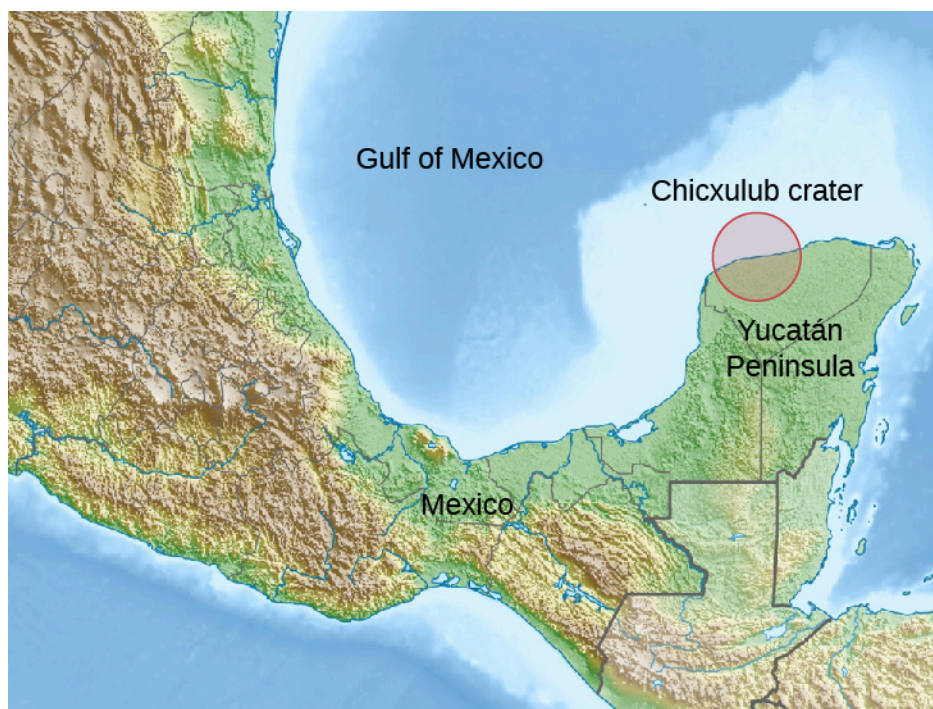
Figure 8.22 Site of the Chicxulub Crater. This map shows the location of the impact crater created 65 million years ago on Mexico’s

The impact that led to the extinction of dinosaurs released energy equivalent to 5 billion Hiroshima-size nuclear bombs and excavated a crater 200 kilometers across and deep enough to penetrate through Earth’s crust. This large crater, named Chicxulub for a small town near its center, has subsequently been buried in sediment, but its outlines can still be identified (Figure 8.22). The explosion that created the Chicxulub crater lifted about 100 trillion tons of dust into the atmosphere. We can determine this amount by measuring the thickness of the sediment layer that formed when this dust settled to the surface.