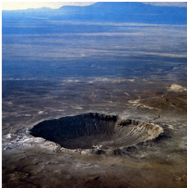
Figure 8.21 Meteor Crater in Arizona. Here we see a 50,000-year-old impact crater made by the collision of a 40-meter lump of iron with our planet. Although impact craters are common on less active bodies such as the Moon, this is one of the very few well-preserved craters on Earth.

The best-known recent crater on Earth was formed about 50,000 years ago in Arizona. The projectile in this case was a lump of iron about 40 meters in diameter. Now called Meteor Crater and a major tourist attraction on the way to the Grand Canyon, the crater is about a mile across and has all the features associated with similar-size lunar impact craters ( Figure 8.21 ). Meteor Crater is one of the few impact features on Earth that remains relatively intact; some older craters are so eroded that only a trained eye can distinguish them. Nevertheless, more than 150 have been identified. (See the list of suggested online sites at the end of this chapter if you want to find out more about these other impact scars.)