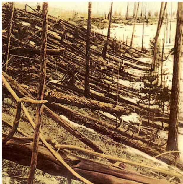
Figure 8.20 Aftermath of the Tunguska Explosion. This photograph, taken 19 years after the blast, shows a part of the forest that was destroyed by the 5-megaton explosion, resulting when a stony projectile about the size of a small office building (40 meters in diameter) collided with our planet.

The collision of interplanetary debris with Earth is not a hypothetical idea. Evidence of relatively recent impacts can be found on our planet's surface. One well-studied historic collision took place on June 30, 1908, near the Tunguska River in Siberia. In this desolate region, there was a remarkable explosion in the atmosphere about 8 kilometers above the surface. The shock wave flattened more than a thousand square kilometers of forest ( Figure 8.20 ). Herds of reindeer and other animals were killed, and a man at a trading post 80 kilometers from the blast was thrown from his chair and knocked unconscious. The blast wave spread around the world, as recorded by instruments designed to measure changes in atmospheric pressure.