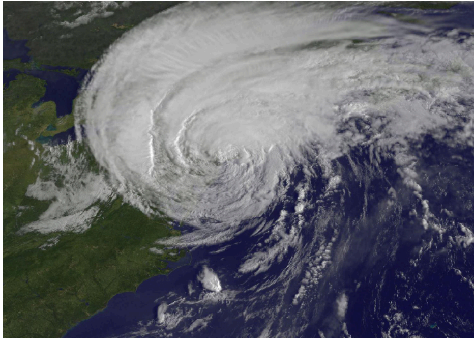
Figure 8.13 Storm from Space. This satellite image shows Hurricane Irene in 2011, shortly before the storm hit land in New York City. The combination of Earth's tilted axis of rotation, moderately rapid rotation, and oceans of liquid water can lead to violent weather on our planet.

Climate is a term used to refer to the effects of the atmosphere that last through decades and centuries. Changes in climate (as opposed to the random variations in weather from one year to the next) are often difficult to detect over short time periods, but as they accumulate, their effect can be devastating. One saying is that “Climate is what you expect, and weather is what you get.” Modern farming is especially sensitive to temperature and rainfall; for example, calculations indicate that a drop of only 2 °C throughout the growing season would cut the wheat production by half in Canada and the United States. At the other extreme, an increase of 2 °C in the average temperature of Earth would be enough to melt many glaciers, including much of the ice cover of Greenland, raising sea level by as much as 10 meters, flooding many coastal cities and ports, and putting small islands completely under water.