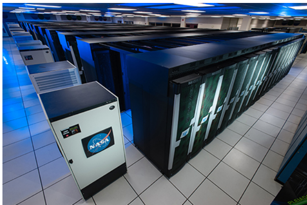
Figure 3.13 Modern Computing Power. These supercomputers at NASA's Ames Research Center are capable of tracking the motions of more than a million objects under their mutual gravitation.

However, the problem is complicated by the fact that the other stars are also moving and thus changing the effect they will have on our star. Therefore, we must simultaneously calculate the acceleration of each star produced by the combination of the gravitational attractions of all the others in order to track the motions of all of them, and hence of any one. Such complex calculations have been carried out with modern computers to track the evolution of hypothetical clusters of stars with up to a million members ( Figure 3.13 ).