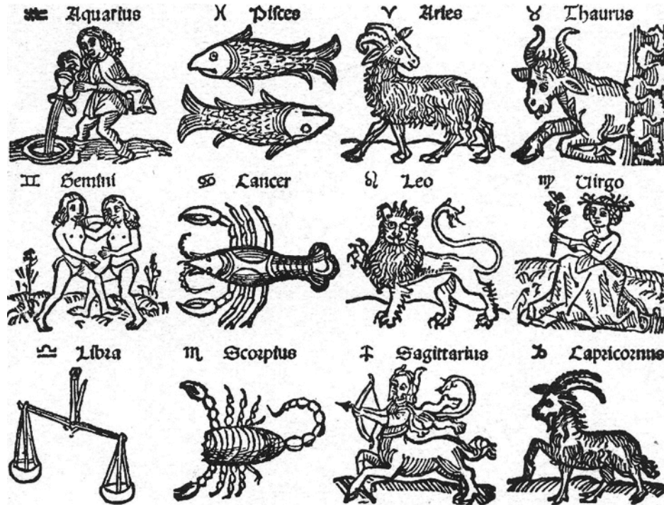
Figure 2.15 Zodiac Signs. The signs of the zodiac are shown in a medieval woodcut.

The key to natal astrology is the horoscope , a chart showing the positions of the planets in the sky at the moment of an individual's birth. The word “horoscope” comes from the Greek words hora (meaning “time”) and skopos (meaning a “watcher” or “marker”), so “horoscope” can literally be translated as “marker of the hour.” When a horoscope is charted, the planets (including the Sun and Moon, classed as wanderers by the ancients) must first be located in the zodiac. At the time astrology was set up, the zodiac was divided into 12 sectors called signs (Figure 2.15), each 30° long. Each sign was named after a constellation in the sky through which the Sun, Moon, and planets were seen to pass—the sign of Virgo after the constellation of Virgo, for example.