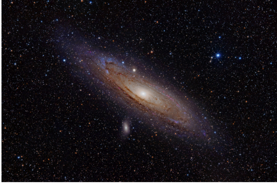
Figure 25.20 Andromeda Galaxy (M31). This neighboring spiral looks similar to our own Galaxy in that it is a disk galaxy with a central bulge. Note the bulge of older, yellowish stars in the center, the bluer and younger stars in the outer regions, and the dust in the disk that blocks some of the light from the bulge.

stars in the spiral arms population I and all the stars in the halo and globular clusters population II .