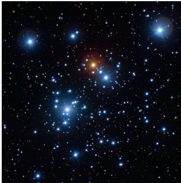
Figure 22.7 Jewel Box (NGC 4755). This open cluster of young, bright stars is about 6400 light-years away from the Sun. Note the contrast in color between the bright yellow supergiant and the hot blue main-sequence stars. The name comes from John Herschel's nineteenth-century description of it as “a casket of variously colored precious stones.”

Open clusters are found in the disk of the Galaxy. They have a range of ages, some as old as, or even older than, our Sun. The youngest open clusters are still associated with the interstellar matter from which they formed. Open clusters are smaller than globular clusters, usually having diameters of less than 30 light-years, and they typically contain only several dozen to several hundreds of stars ( Figure 22.7 ). The stars in open clusters usually appear well separated from one another, even in the central regions, which explains why they are called “open.” Our Galaxy contains thousands of open clusters, but we can see only a small fraction of them. Interstellar dust, which is also concentrated in the disk, dims the light of more distant clusters so much that they are undetectable.