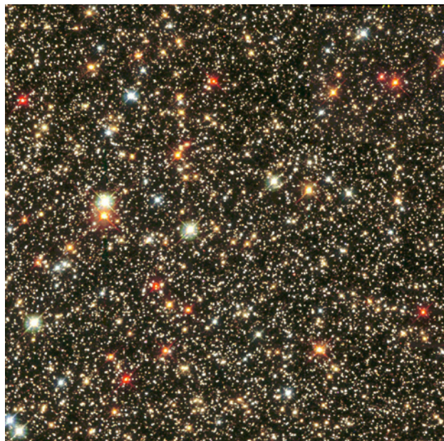
Figure 17.3 Sagittarius Star Cloud. This image, which was taken by the Hubble Space Telescope, shows stars in the direction toward the center of the Milky Way Galaxy. The bright stars glitter like colored jewels on a black velvet background. The color of a star indicates its temperature. Blue-white stars are much hotter than the Sun, whereas red stars are cooler. On average, the stars in this field are at a distance of about 25,000 light-years (which means it takes light 25,000 years to traverse the distance from them to us) and the width of the field is about 13.3 light-years.

Look at the beautiful picture of the stars in the Sagittarius Star Cloud shown in Figure 17.3 . The stars show a multitude of colors, including red, orange, yellow, white, and blue. As we have seen, stars are not all the same color because they do not all have identical temperatures. To define color precisely, astronomers have devised quantitative methods for characterizing the color of a star and then using those colors to determine stellar temperatures. In the chapters that follow, we will provide the temperature of the stars we are describing, and this section tells you how those temperatures are determined from the colors of light the stars give off.